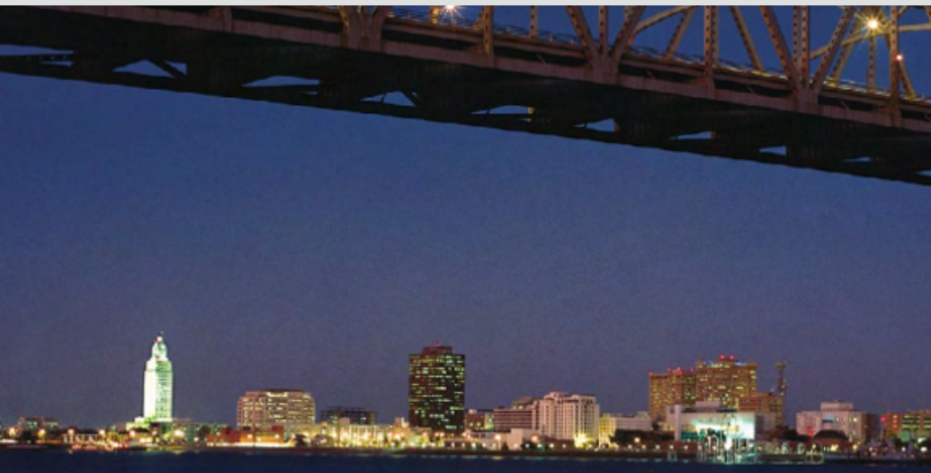
BATON ROUGE, LA