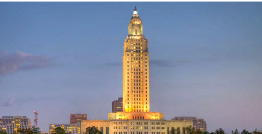
STATE CAPITOL BUILDING