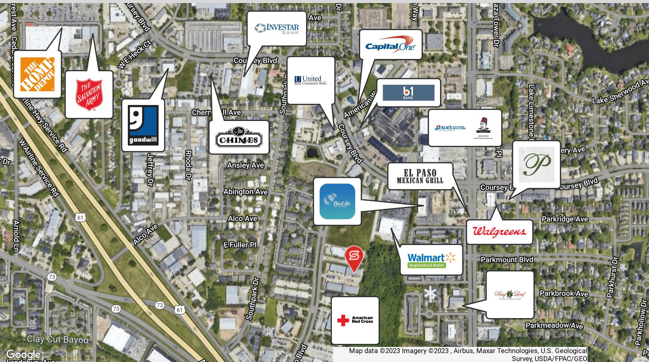
Map data ©2023 Imagery ©2023, Airbus, Maxar Technologies, U.S. Geological Survey, USDA/FPAC/GEO