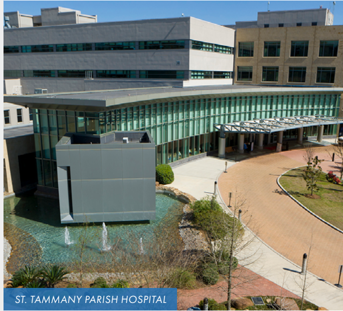
ST. TAMMANY PARISH HOSPITAL

With a population of approximately 255,000 and a civilian labor force of over 126,000, St. Tammany offers a HIGHLYSKILLED, HIGHLY-TRAINED WORKFORCE for businesses in any industry. The NATIONALLY-RECOGNIZED K-12 education system and world-renowned professional and technical schools produce dedicated new workers every year. Students’ ACT scores consistently rank above the national average while the unemployment rate in St. Tammany consistently remains below the national average.